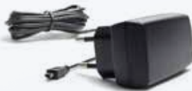
VELOX® AC power supply (EU)